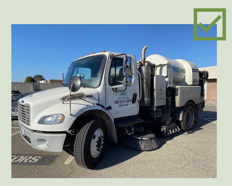
We do title them If they look like a truck/or can drive on the highway