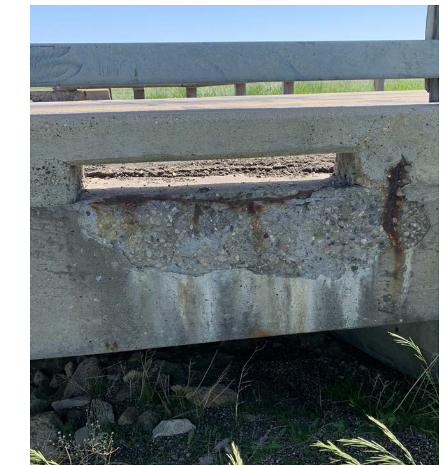
Concrete Girder Spalling with Exposed Rebar at Bridge 1806-035.070