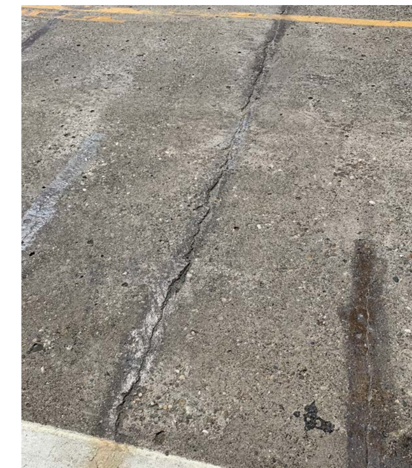
Deck Cracking at Bridge 24-000.320