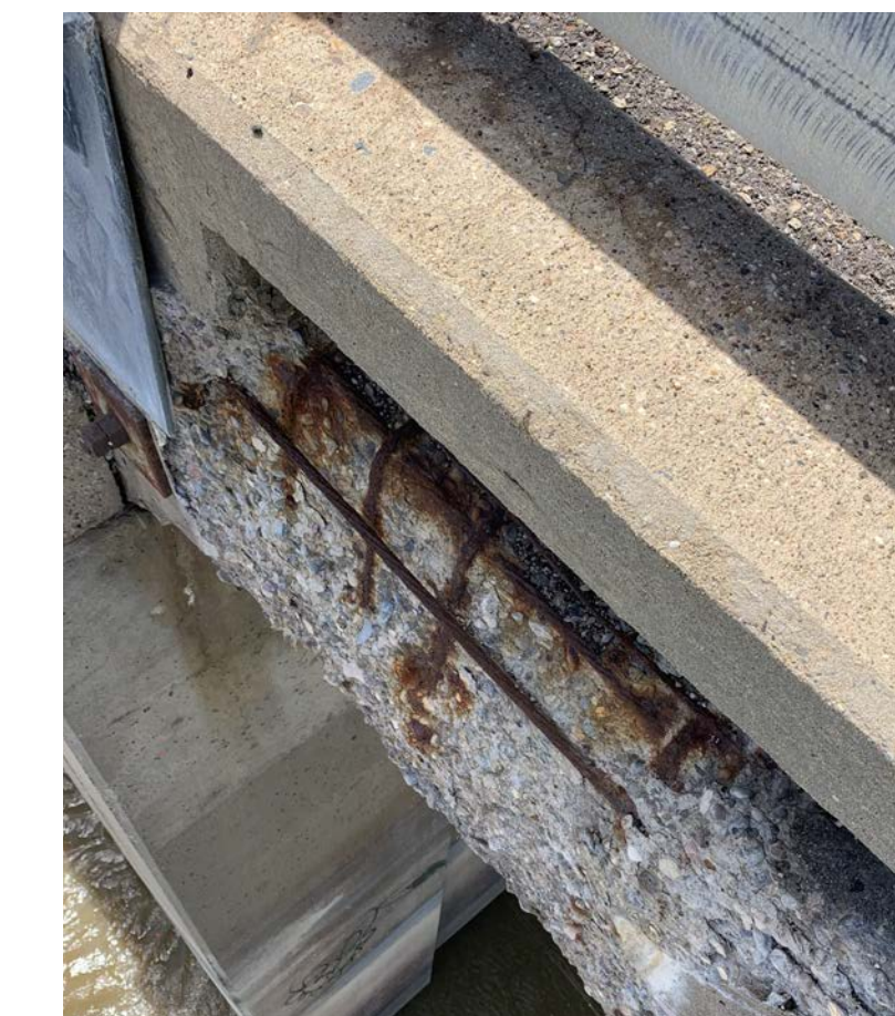
Concrete Girder Spalling with Exposed Rebar at Bridge 1806-034.280