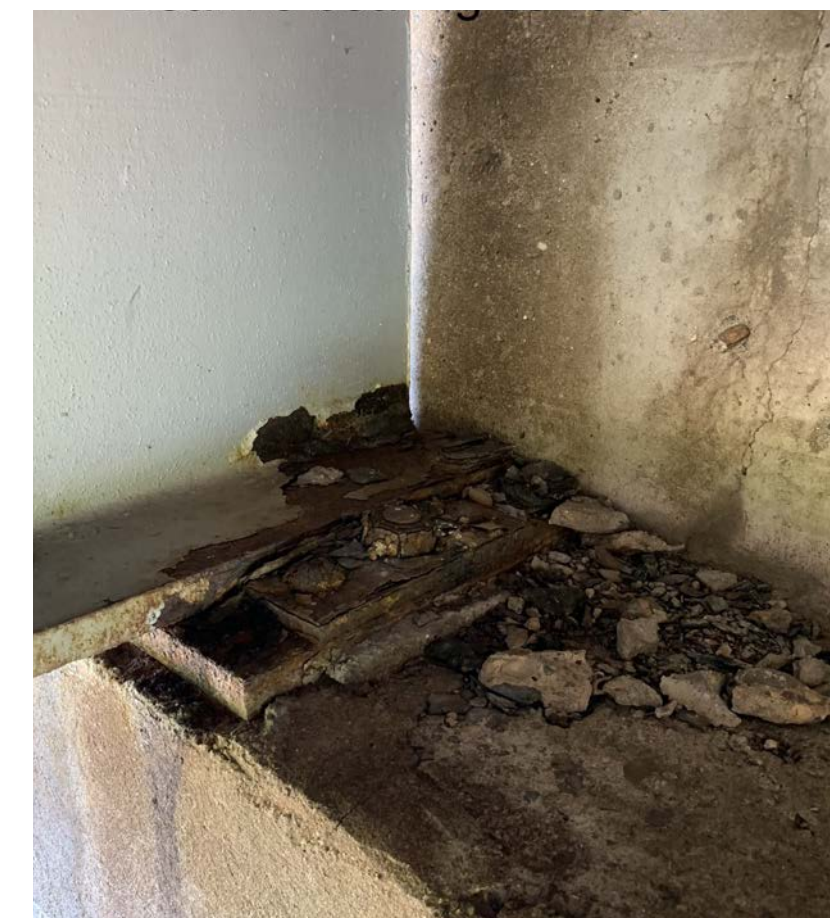
Girder/Bearing Corrosion and Abutment Cracking/Spalling at Bridge 24-000.320