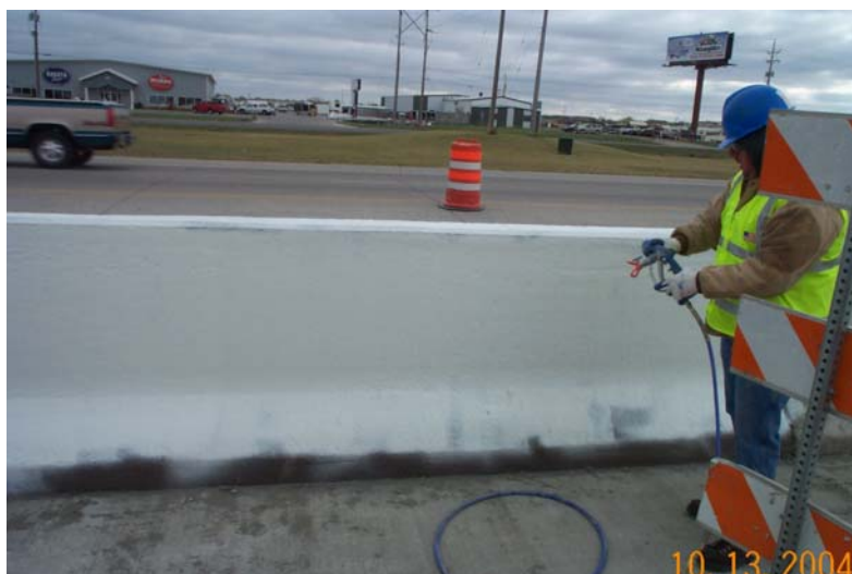
Photo 1 - Texcote Representative demonstrating the application of XL-70C material.

The Texcote representative initially had problems achieving an even coat because the material clogged the paint sprayer. After changing to a new nozzle, the XL-70C was applied more evenly. Personnel from Prairie Supply, the contractor awarded the project, continued to apply the product to the remainder of the barriers. Photo 1 shows the Texcote representative applying the product and Photo 2 shows the contractor applying the product.