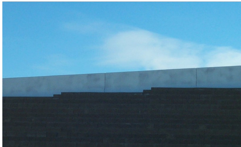
Photo 4 – Cement-based material on Jersey barrier in the control section.