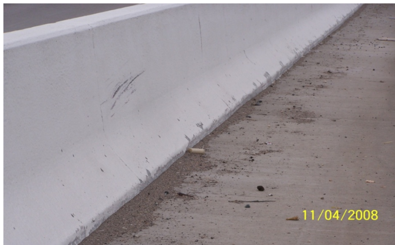
Photo 8 – Control section, without guardrail, exhibiting similar distress as XL-70C