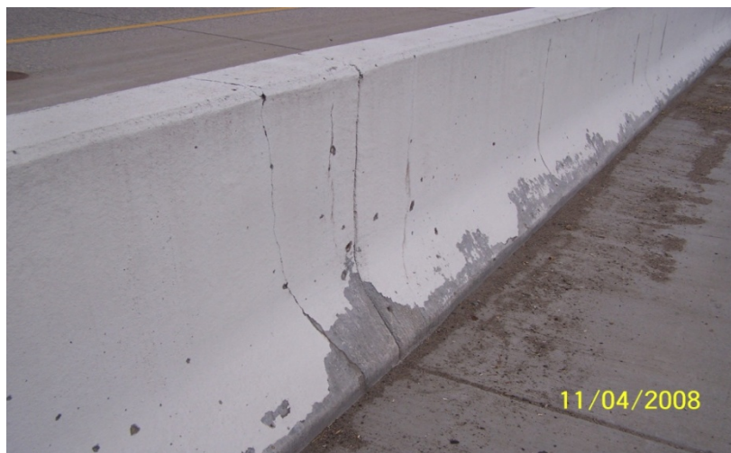
Photo 5 – Texcote severe distress at bottom of Jersey barrier and eroding from surface voids.