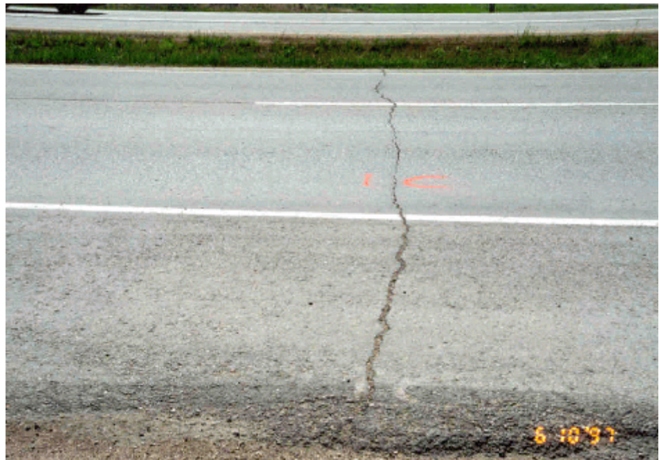
Photo 22. A view of a typical crack in the east control section.