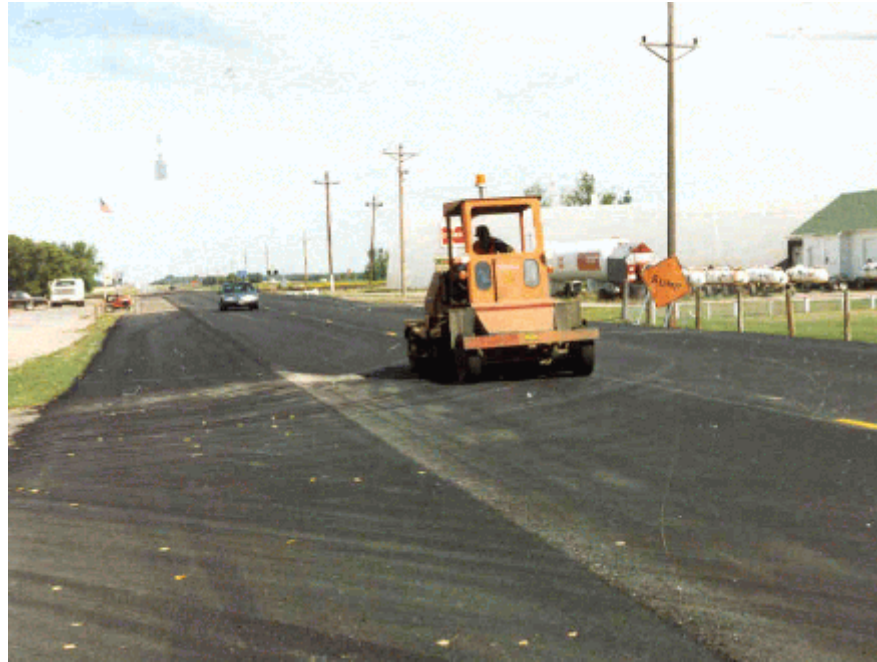
Photo 1. View of the sweeping process on Hwy 32.

leveling course that was laid several days earlier. Photo 1 shows the sweeping process. After the surface was cleaned the geogrid was rolled out. Photo 2 shows the Stratagrid A-100 rolled out in the southbound lane.