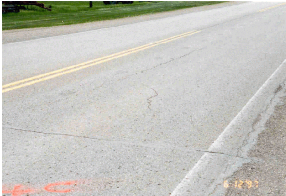
Photo 15. A view of typical longitudinal cracking occurring in the control section.