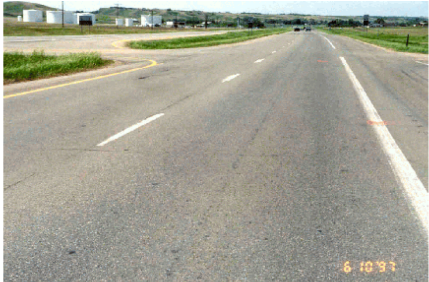
Photo 17. An overview of the stratagrid test section

The test section registered nine full length transverse cracks and one longitudinal crack approximately 30' in length located along one of the shoulders. Photo 17 shows a view of the Stratagrid test section. Photo 18 shows a view of a typical crack in the test section.