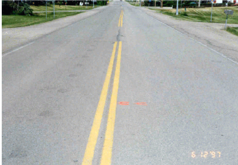
Photo 12. View of the control section looking north.

Photo 12 shows an overview of the control section looking north. Photo 13 is a view of a typical transverse crack located in the control section.