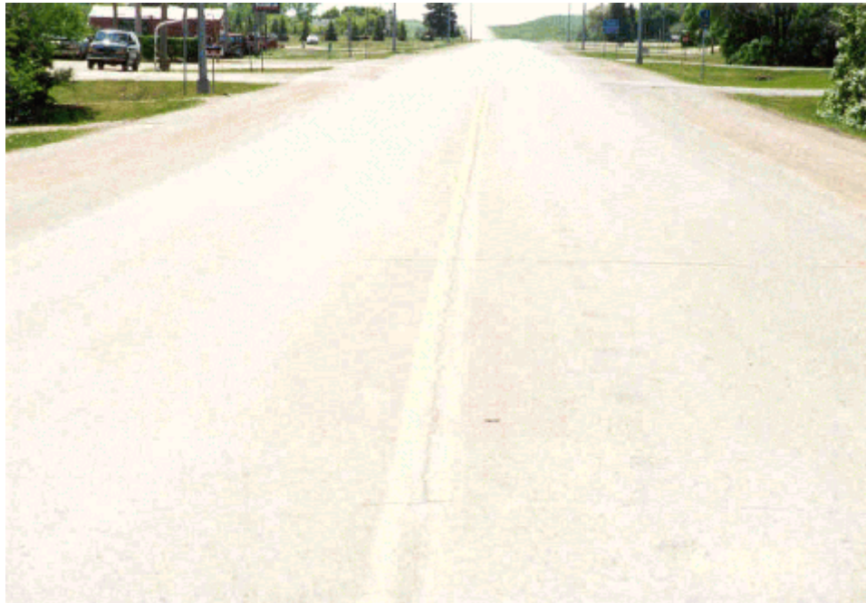
Photo 8. Overview of the test section looking north.

In general the distresses do not appear to be getting worse in the test section. Materials and Research registered approximately 9 full length transverse cracks, 3 half-length transverse cracks, and 1 longitudinal crack in the test section. Photo 8 is an overview of the test