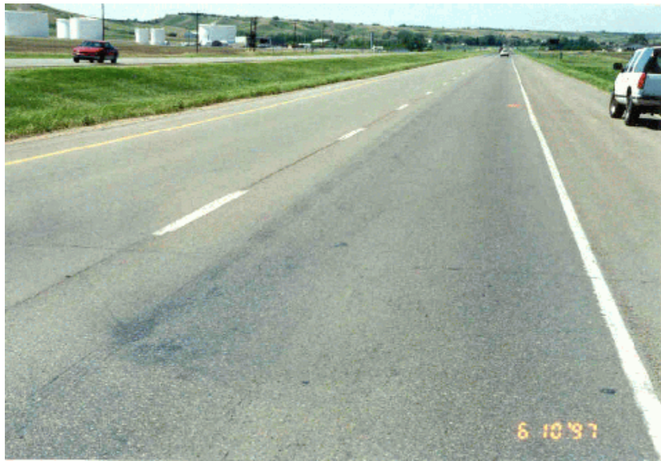
Photo 23. An overview of the west control section.

Photo 23 shows an overview of the west control section. The west control section registered eight full transverse cracks and a 30' longitudinal crack in the passing lane. Photo 24 shows a typical crack located in the west control section.