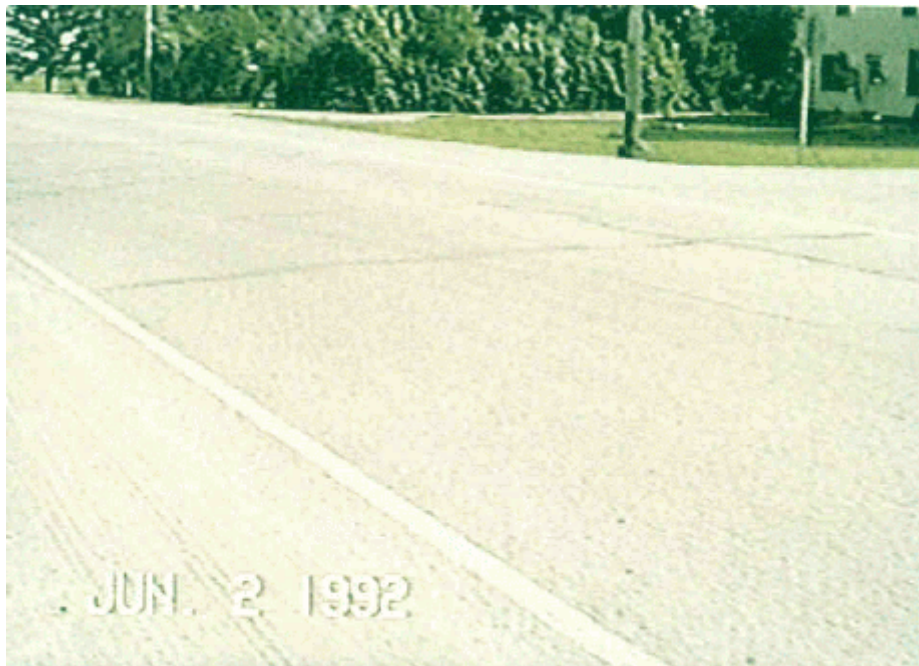
Photo 11. Similar view of the area shown in photo 10 taken before the asphalt overlay and stratagrid were laid down.

photo 11 have not all reflected through at this time. Also the test section appeared to