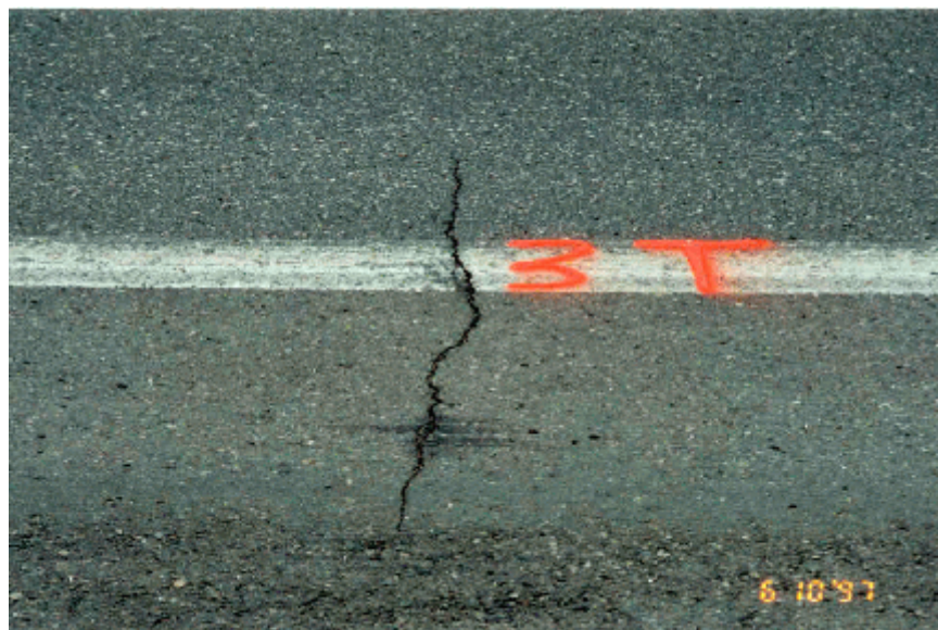
Photo 20. A view of a typical shoulder crack that is extending into the mainline.

test section has Stratagrid present in the shoulders also.