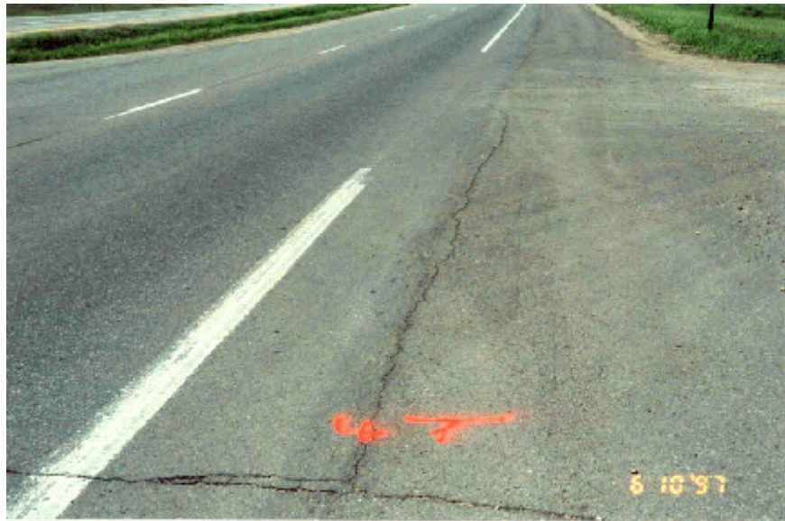
Photo 19. A view of a longitudinal crack located in the shoulder of the test section

Photo 19 shows a longitudinal crack present in the shoulder (driving lane). Photo 20 shows one of several shoulder cracks present in the test section. These cracks have increased in length over the last two years but not to any significant amount. As was previously mentioned the