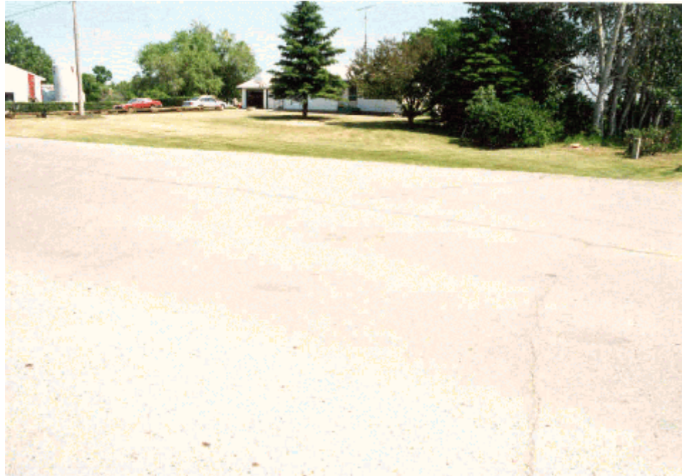
Photo 14. View of an area displaying both transverse and longitudinal cracking in the control section.

Photo 14 is an overview of an area suffering from a combination of longitudinal and transverse cracking located in the control section. Photo 15 is a view of typical longitudinal cracking. Upon viewing the preconstruction video, it would appear that most or all of the distresses in the control section had already reflected through.