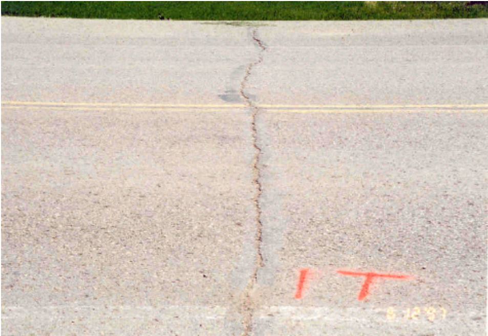
Photo 9. View of a transverse crack in the stratagid test section

Photo 9 is a view of a typical transverse crack located in the test section.