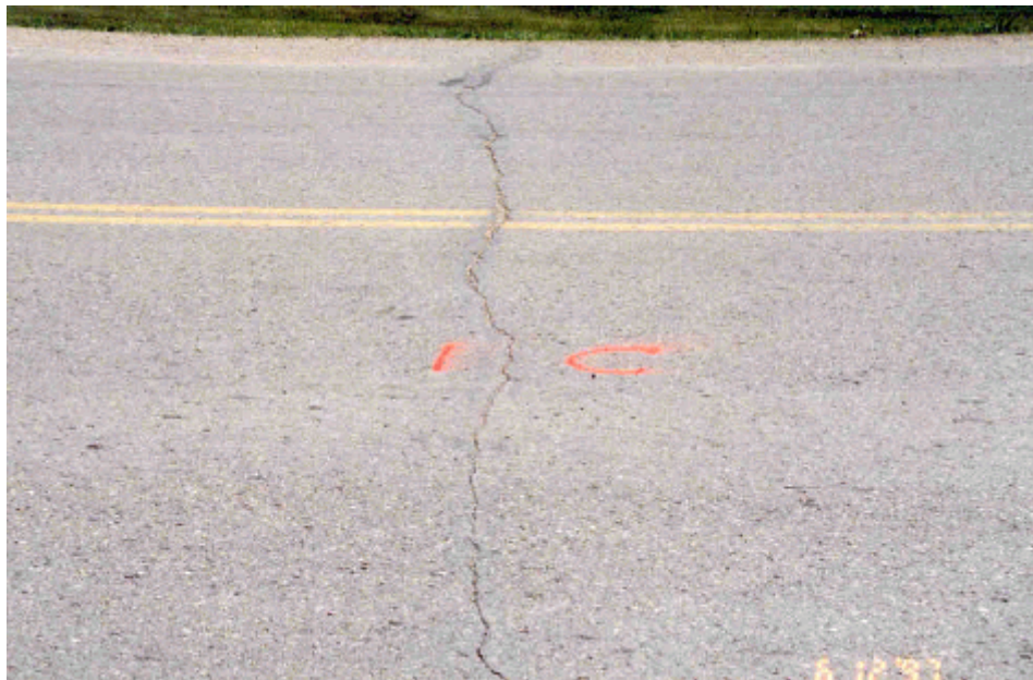
Photo 13. View of a typical transverse crack in the control section.