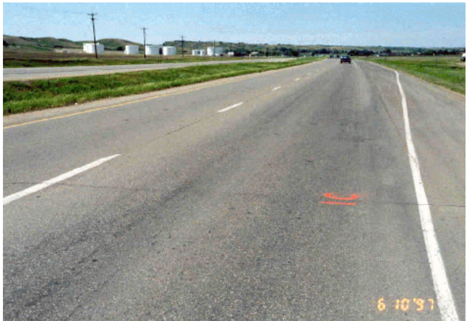
Photo 21. An overview of the east control section.

Photo 21 shows an overview of the east control section. The east control section registered 12 full transverse cracks and a 30' longitudinal crack in the shoulder. Photo 22 shows a typical crack located in the east control section.