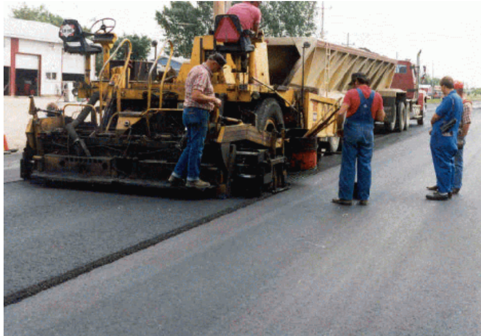
Photo 5. View of the second lift of HBP being applied over the geogrid.

optimum interaction and effectiveness with geogrid was that the thickness of the asphalt layer, above the reinforcement, should not exceed 3-1/2", nor be less than 2 inches. Upon further