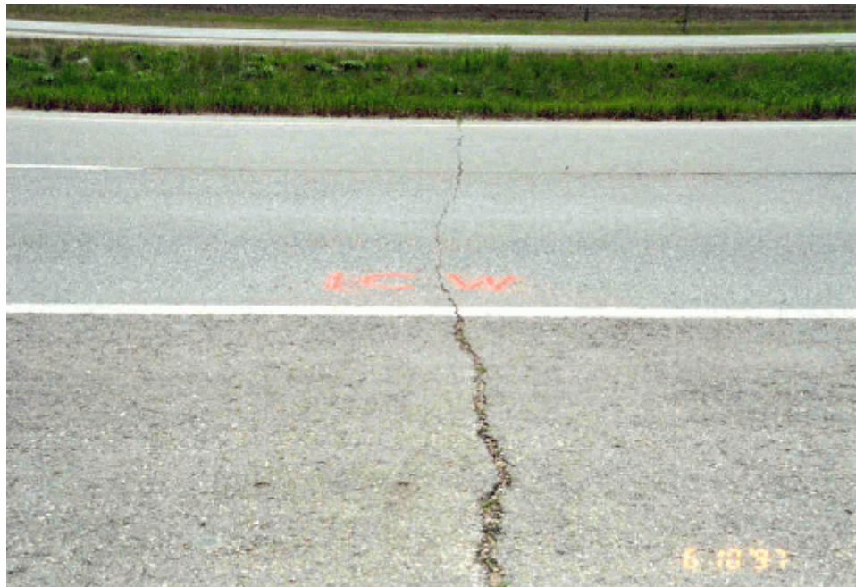
Photo 24. A view of a typical crack in the west control section.

Compared to last year's evaluation, all of the cracks, in general, do not appear to be widening to any appreciable amount.