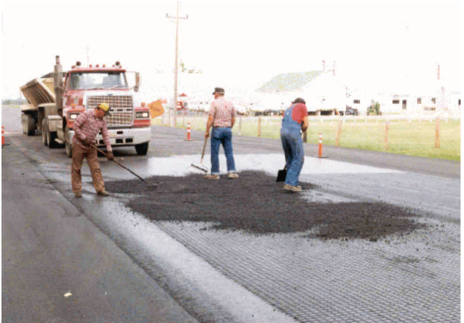
Photo 4. View of workers spreading hot mix on the leading edge of the geogrid to ensure it would stay in place.

Once final preparations were complete, the hot mix was brought in as shown in photo 5 on the following page.