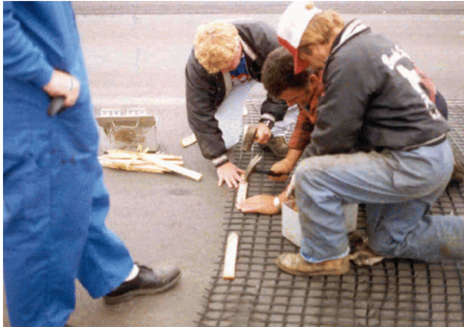
Photo 7. View of the lathe-nail system.

The prime contractor for project NH-4-002(046)130 was Border States Paving out of Fargo, North Dakota. The test section is west of Minot, North Dakota on the westbound lanes of