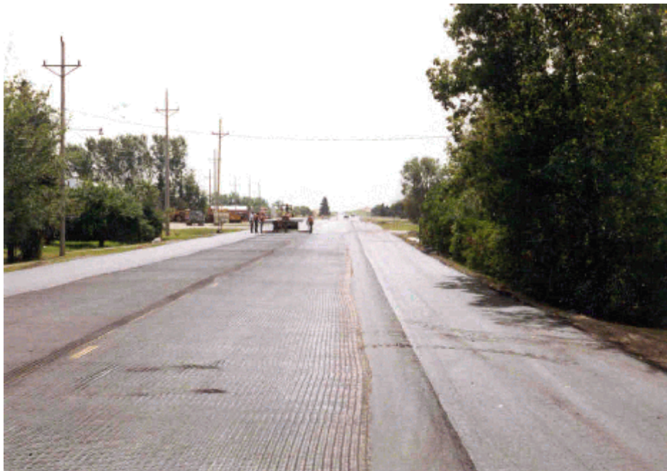
Photo 2. View of the geogrid rolled out.

As each roll of Stratagrid A-100 was rolled out and a new roll