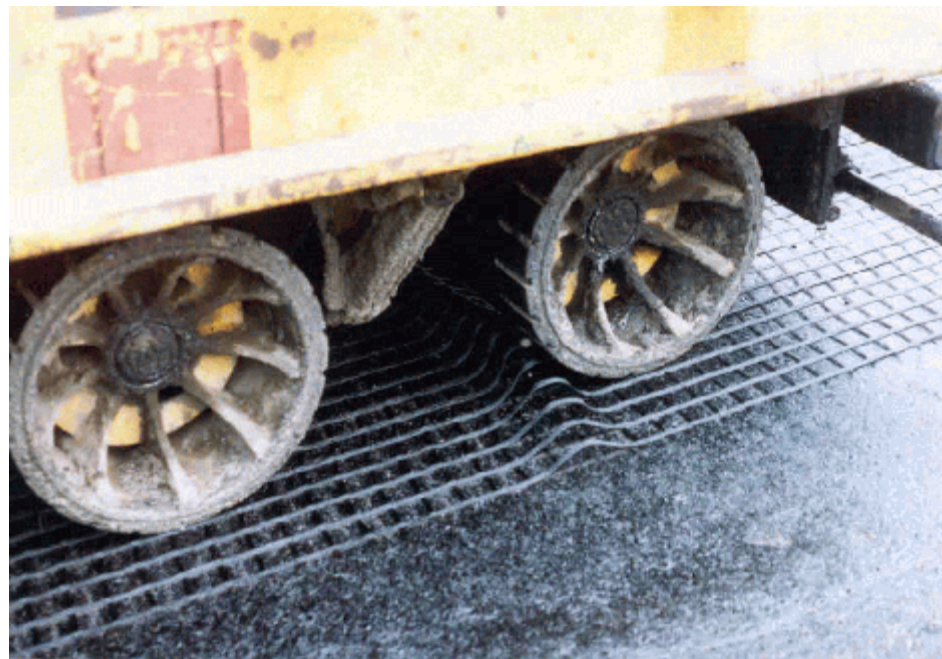
Photo 6. View of the geogrid being lifted by the laydown machine wheels.