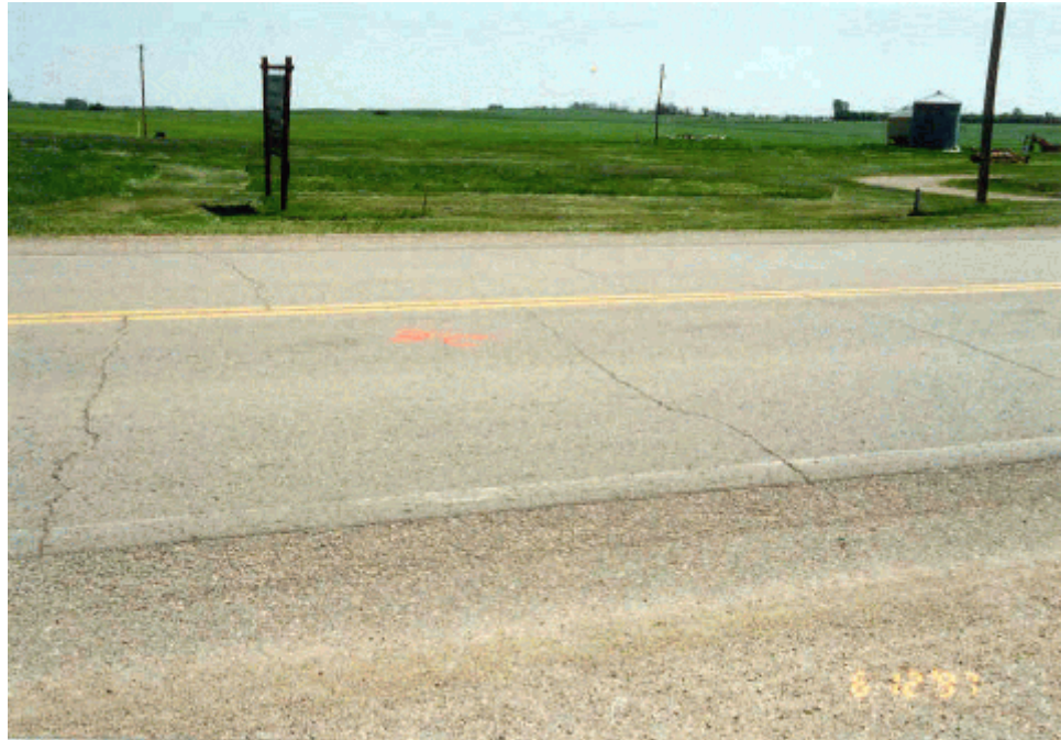
Photo 16. View of the transverse cracking emerging in the control section. entire roadway. Upon viewing the preconstruction video, it was difficult to locate any of these distresses prior to the overlay.

Part of the increase in transverse cracking in the control section is due to the type of cracking shown in photo 16. These cracks appear tighter and more closely spaced. They also rarely extend across the