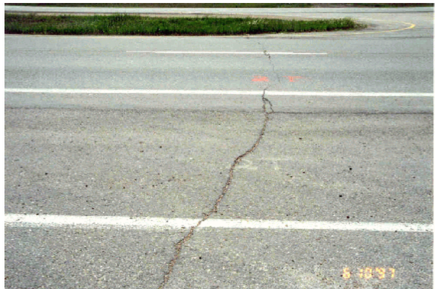
Photo 18. A view of a typical transverse crack located in the stratagrid test section.