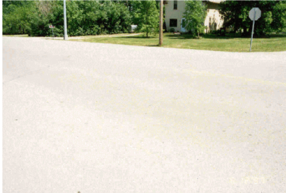
Photo 10. Overview of an isolated area located in the test section

Photo 10 is an overview of an area located in the test section taken in 1997. Photo 11 is a view of the same area taken before the asphalt overlay and Stratagrid were applied. It would appear from these photos that the cracks shown in