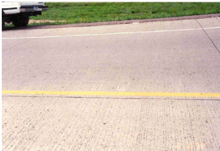
Photo 11 - Third evaluation of E-2706 (left), and E-3427 (right), white latex stripes. 261 days after installation.

Photo 11, (taken during the third evaluation), depicts the test stripes approximately 261 days after installation. The photo indicates that only minor traces of the white latex E-2706 and the E-3427 material remain near the edges of the PCC pavement.