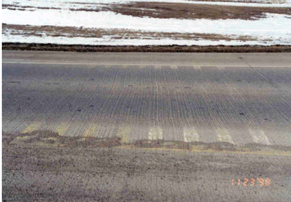
Photo 16 - Second evaluation of yellow and white solvent-borne test stripes. 66 days after installation.

Photo 17, (taken during the third evaluation), depicts the test stripes approximately 261 days after installation. The photo indicates that only minor traces of the solvent-borne material remain near the edges of the PCC pavement.