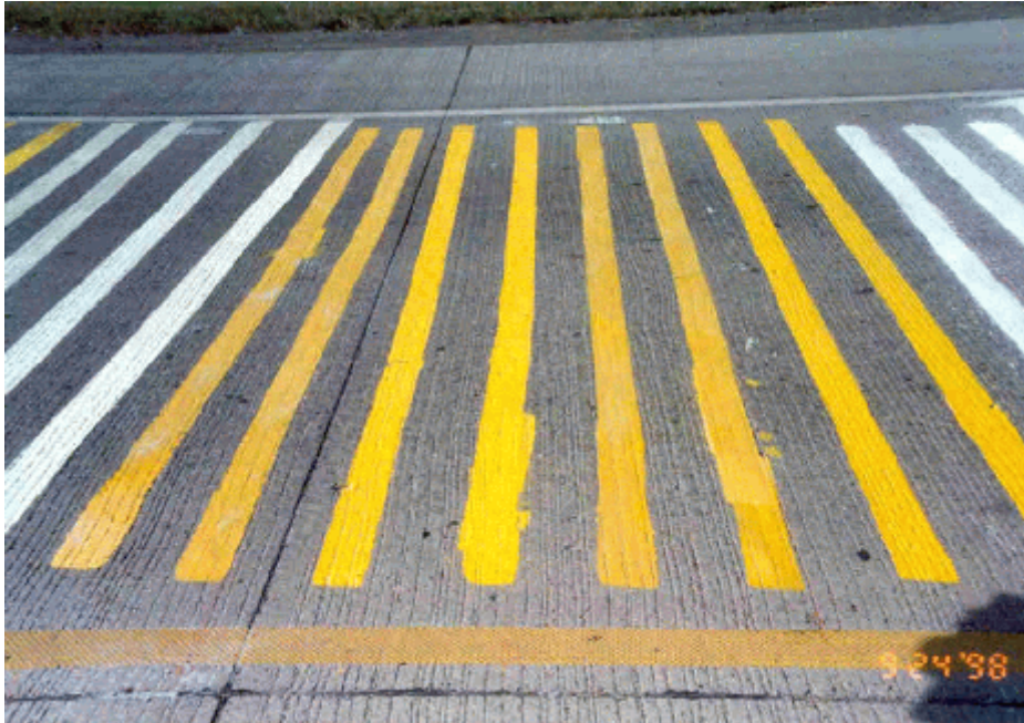
Photo 4 - Middle eight stripes on concrete test section. The four yellow latex E-2706 stripes (left side). Four yellow latex E-3427 stripes (right side).

Photo 4 depicts the middle eight stripes located in the same concrete test section taken immediately after construction. The four yellow stripes on the left side of the photo are painted with latex E-2706 and the four yellow stripes on the right are painted with latex E-3427.