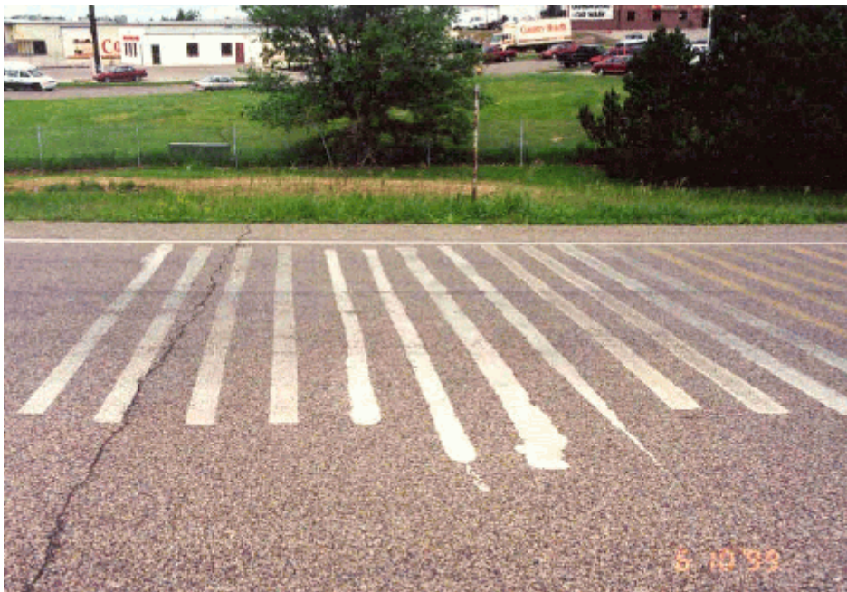
Photo 23 - Third evaluation of white paint stripes on the asphalt test section. 261 days after installation.

Photo 23, (taken during the third evaluation), depicts the test stripes approximately 261 days after installation. The photo indicates that all white stripes can be observed. Ranking the materials by visual observation; (1) E-2706 latex stripes, (2) solvent-borne stripes, and (3) E-3427 latex stripes.