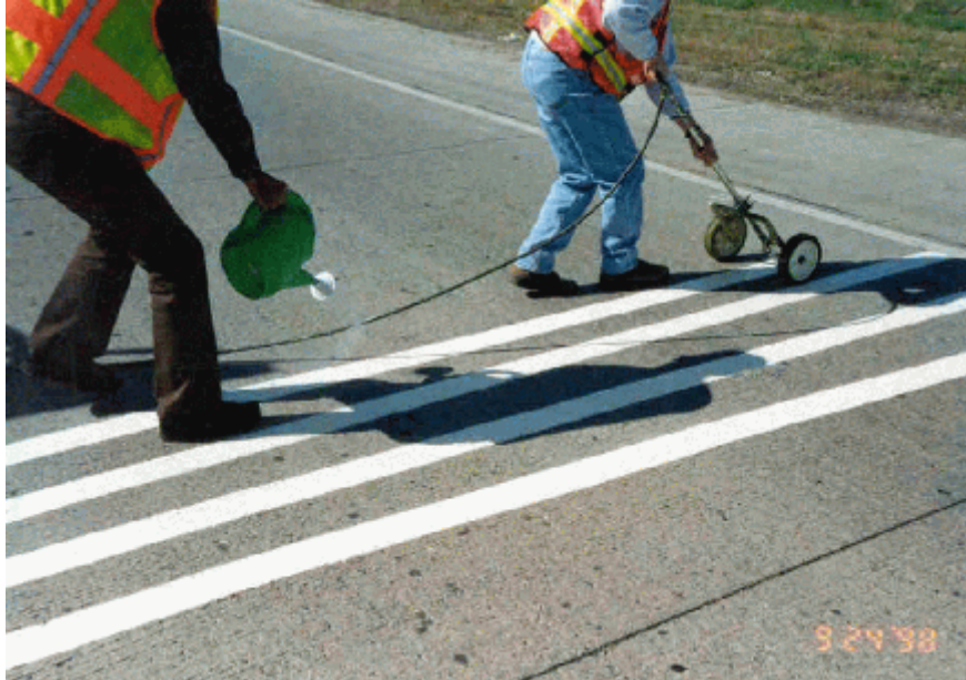
Photo 2 - Maintenance forces applying white solvent-borne paint stripes followed by glass beads. Stripes installed on PCC surface.

Photo 3 shows eight test stripes located in the concrete test section taken immediately after construction. The four yellow stripes on the left side of the photo are painted with solvent-borne paint and the four white stripes on the right are painted with solvent-borne paint. For each set of four stripes the left two stripes has an application of glass beads.