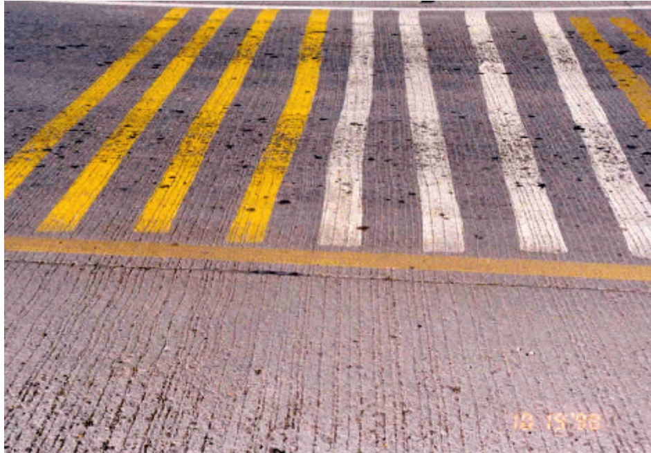
Photo 15 - First evaluation of yellow and white solvent-borne test stripes. 26 days after installation.

Photo 15, (taken during the first evaluation) depicts the solvent-borne yellow and solvent-borne white material as they appeared during the first evaluation. During this time it appeared that both of the paints were experiencing limited wear, however, some of the darker areas exhibited was mud stuck to the pavement surface. It was also apparent that the latex E-3427 material appeared comparable in performance to the solvent-borne material.