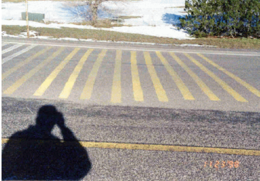
Photo 19 - Second evaluation of yellow paint stripes on the asphalt test section. 66 days after installation.

Photo 20, (taken during the third evaluation), depicts the test stripes approximately 261 days after installation. The photo indicates that all yellow stripes can be observed. Ranking the materials by visual observation; (1) E-2706 latex stripes, (2) solvent-borne stripes, and (3) E-3427 latex stripes. Retroreflectivity readings were taken to compare the current condition of the paint systems. The data is included in Appendix A.