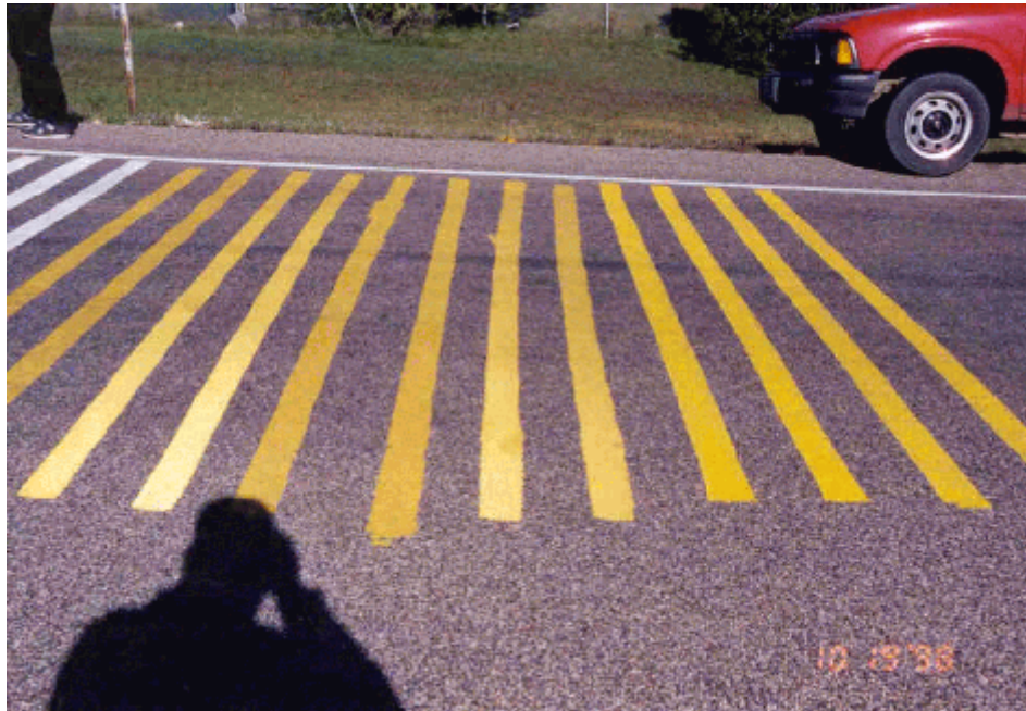
Photo 18 - First evaluation of yellow paint stripes on the asphalt test section. 26 days after installation.

Photo 18, (taken during the first evaluation), depicts a view of all of the yellow paint stripes in the asphalt test section 26 days after installation. Beginning from the left, the photo depicts the first four latex E-3427 stripes, the middle four latex E-2706 stripes, and the final four solvent-borne stripes. During this time it appeared, from a distance, there was no significant difference in performance from a wearing standpoint. However, upon closer inspection, the solvent-borne material exhibited isolated areas of wear on the tops of some of the larger aggregate chips more subject to traffic. The color of the solvent-borne yellow appeared to stand out slightly more than the both latex materials which appeared to fade.