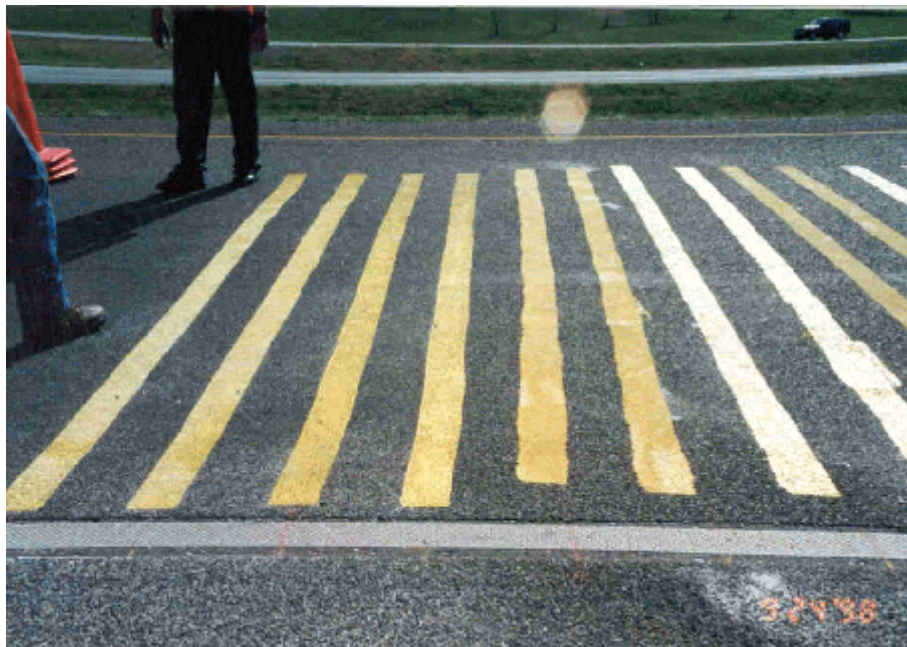
Photo 8 - Final eight test stripes on asphalt test section. Four yellow solvent borne paint stripes (left side). Four yellow latex E-2706 paint stripes (right side).

Photo 8 depicts the final eight test stripes located in the asphalt test section taken immediately after construction. The four yellow stripes on the left side of the photo are painted with solvent-borne paint and the four yellow stripes on the right are painted with latex E-2706.