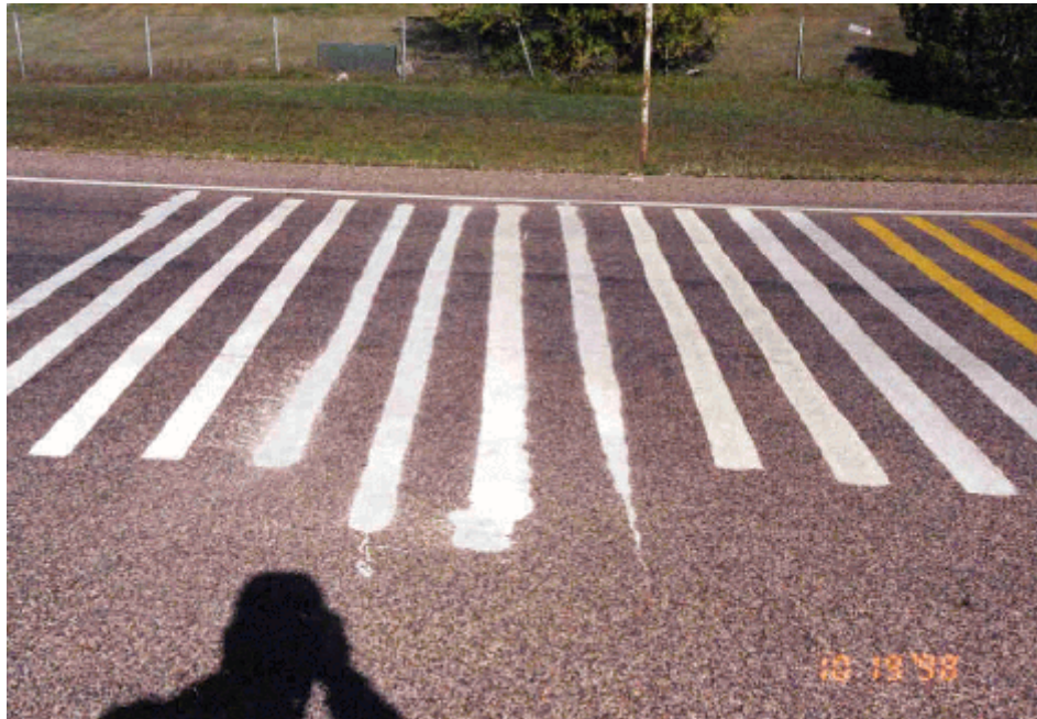
Photo 21 - First evaluation of white paint stripes on the asphalt test section. 26 days after installation.

Photo 21, (taken during the first evaluation), depicts all of the white test stripes located on the asphalt section as they appeared approximately 26 days after installation. The photo depicts, beginning from the left, the first four latex E-3427 stripes, the middle four latex E-2706 stripes, and the final four solvent-borne stripes.