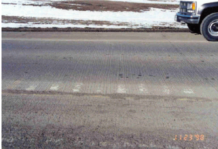
Photo 10 - Second evaluation of E-2706 (left), and E-3427 (right), white latex test stripes. 66 days after installation.

Photo 10, (taken during the second evaluation), depicts the same test stripes approximately 66 days after installation. The white latex E-2706 and the E-3427 material have completely worn away except near the edges of the PCC pavement.