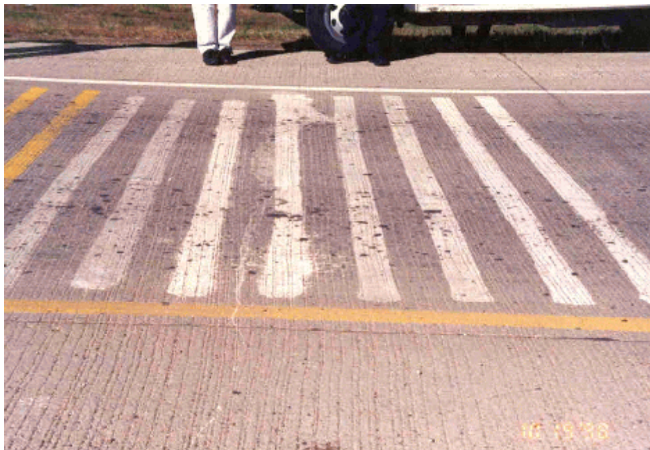
Photo 9 - First evaluation of stripes on concrete test section. 26 days after installation. Four white latex E-2706 (left), and four white latex E-3427 (right) test stripes.

The first, second, and third evaluations were conducted after approximately 26, 66, and, 261 days of exposure to traffic. Photo 9, (taken during the first evaluation), depicts the four latex E-2706 stripes (left hand) and the four latex E-3427 stripes on the concrete pavement 26 days after installation.. The E-2706 material appeared to be holding up, however, the thick application rate, as previously mentioned, may have had some bearing on the performance. The latex E-3427 stripes also appeared to be in good condition.