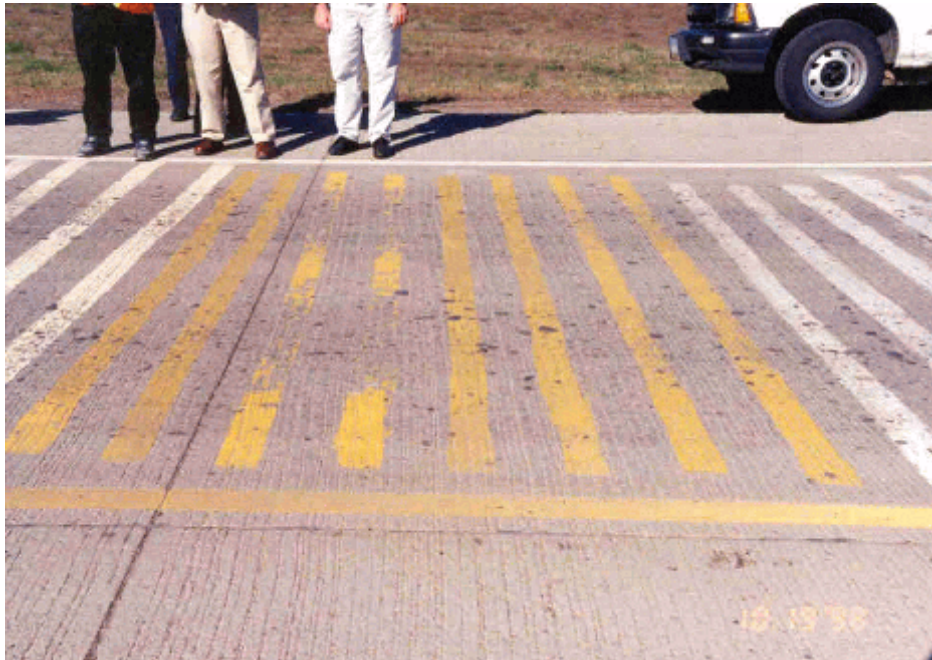
Photo 12 - First evaluation of stripes on concrete test section. 26 days after installation. Four yellow latex E-2706 (left), and four yellow latex E-3427 (right) test stripes.

Photo 12 (during the first evaluation), depicts the yellow latex E-2706 (left four stripes) and the yellow latex E-3427 stripes in the PCC pavement 26 days after installation. During this time the E-3427 (right) material appeared to be performing better than the E-2706 (left) material.