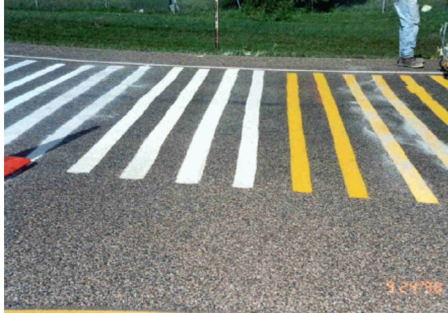
Photo 7 - Middle eight stripes of asphalt test section. Four white solvent-borne paint stripes (left side). Four yellow latex E-3427 stripes (right side).

Photo 8 depicts the final eight test stripes located in the asphalt test section taken immediately after construction. The four yellow stripes on the left side of the photo are painted with solvent-borne paint and the four yellow stripes on the right are painted with latex E-2706.