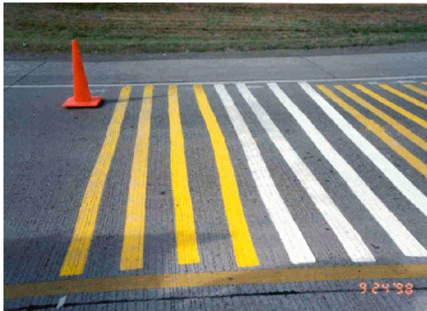
Photo 3 - Eight test stripes on concrete test section. Four yellow solvent-borne paint stripes (left side). Four white solvent-borne paint stripes (right side).

Photo 3 shows eight test stripes located in the concrete test section taken immediately after construction. The four yellow stripes on the left side of the photo are painted with solvent-borne paint and the four white stripes on the right are painted with solvent-borne paint. For each set of four stripes the left two stripes has an application of glass beads.