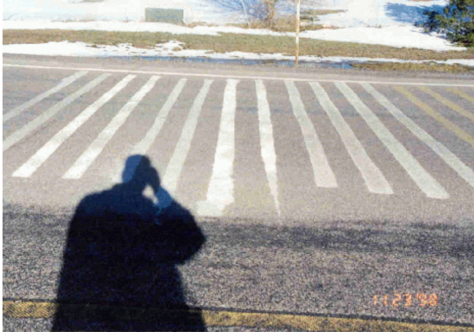
Photo 22 - Second evaluation of white paint stripes on the asphalt test section. 66 days after installation.

Photo 23, (taken during the third evaluation), depicts the test stripes approximately 261 days after installation. The photo indicates that all white stripes can be observed. Ranking the materials by visual observation; (1) E-2706 latex stripes, (2) solvent-borne stripes, and (3) E-3427 latex stripes.