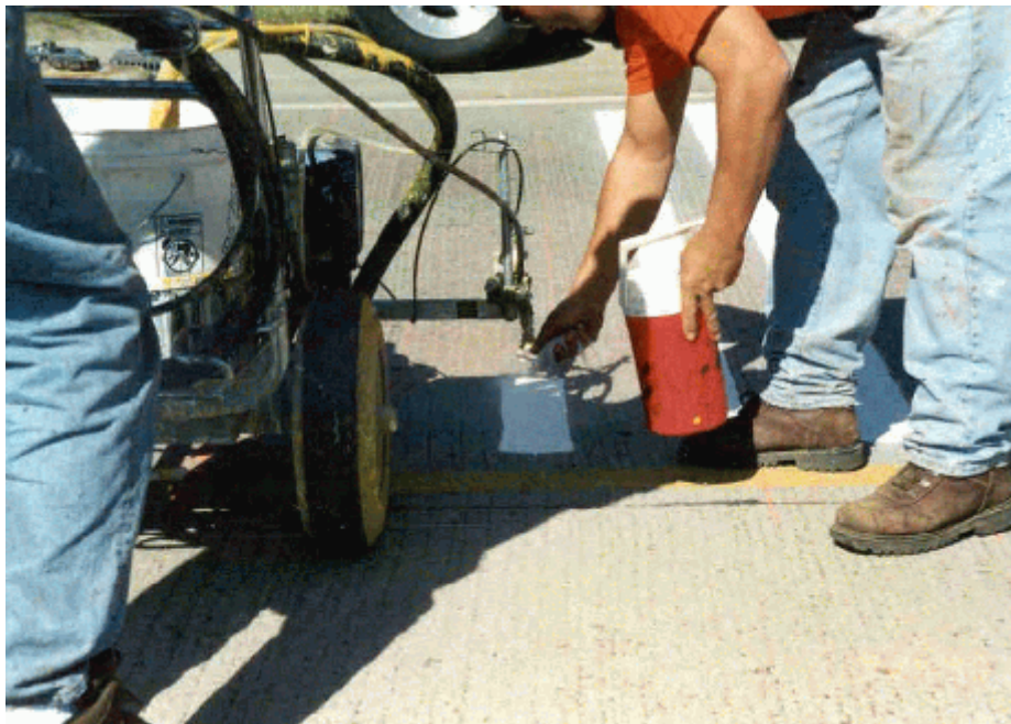
Photo 1 - Contractor applying white latex E-3427 paint stripes followed by glass beads. Stripes installed on PCC surface.

Photo 1 depicts TSS applying the latex E-3427 and the glass beads. The method used to apply the glass beads resulted in uneven application.