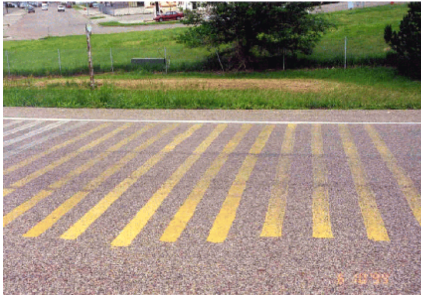
Photo 20 - Third evaluation of yellow paint stripes on the asphalt test section. 261 days after installation.

Photo 20, (taken during the third evaluation), depicts the test stripes approximately 261 days after installation. The photo indicates that all yellow stripes can be observed. Ranking the materials by visual observation; (1) E-2706 latex stripes, (2) solvent-borne stripes, and (3) E-3427 latex stripes. Retroreflectivity readings were taken to compare the current condition of the paint systems. The data is included in Appendix A.