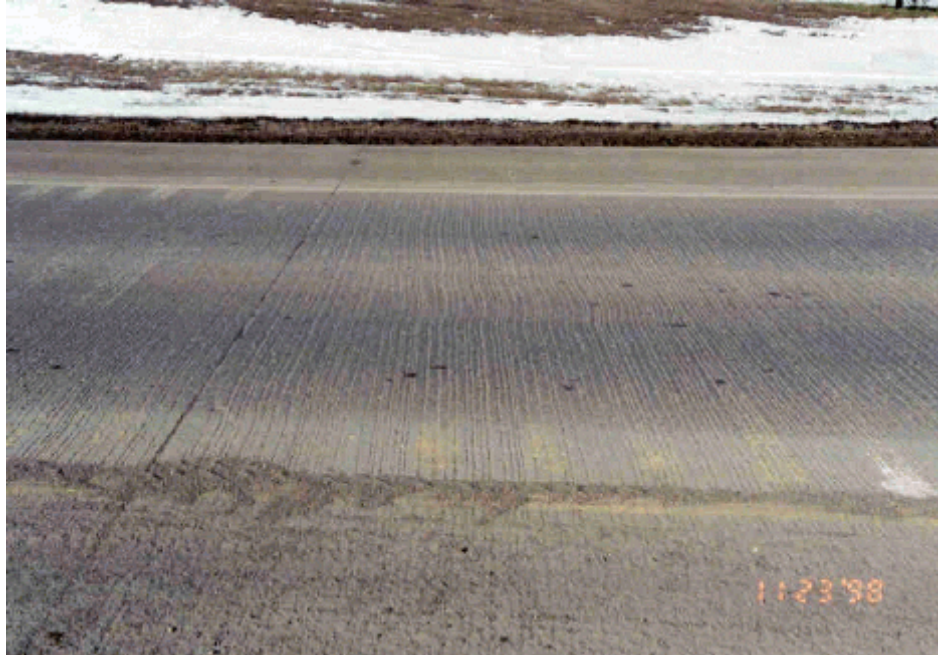
Photo 13 - Second evaluation of E-2706 (left), and E-3427 (right), yellow latex test stripes. 66 days after installation.

Photo 14, (taken during the third evaluation), depicts the test stripes approximately 261 days after installation. The photo indicates that only minor traces of the yellow latex E-2706 and E-3427 material remain near the edges of the PCC pavement.