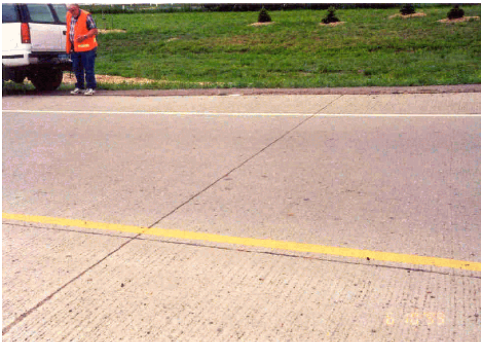
Photo 14 - Third evaluation of E-2706 (left), and E-3427 (right), white latex test stripes. 261 days after installation.

Photo 14, (taken during the third evaluation), depicts the test stripes approximately 261 days after installation. The photo indicates that only minor traces of the yellow latex E-2706 and E-3427 material remain near the edges of the PCC pavement.