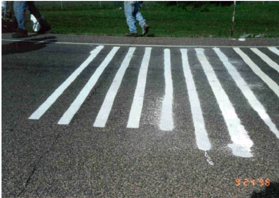
Photo 6 - Four latex E-3427 stripes (left side). Four latex E-2706 stripes (right side). Stripes installed on AC surface.

Photo 6 depicts eight white test stripes applied to an asphalt pavement. This photo was taken immediately after construction. The four stripes on the left side of the photo are painted with latex E-3427 and the four on the right are painted with latex E-2706. For each set of four stripes, the right two stripes, have an application of glass beads.