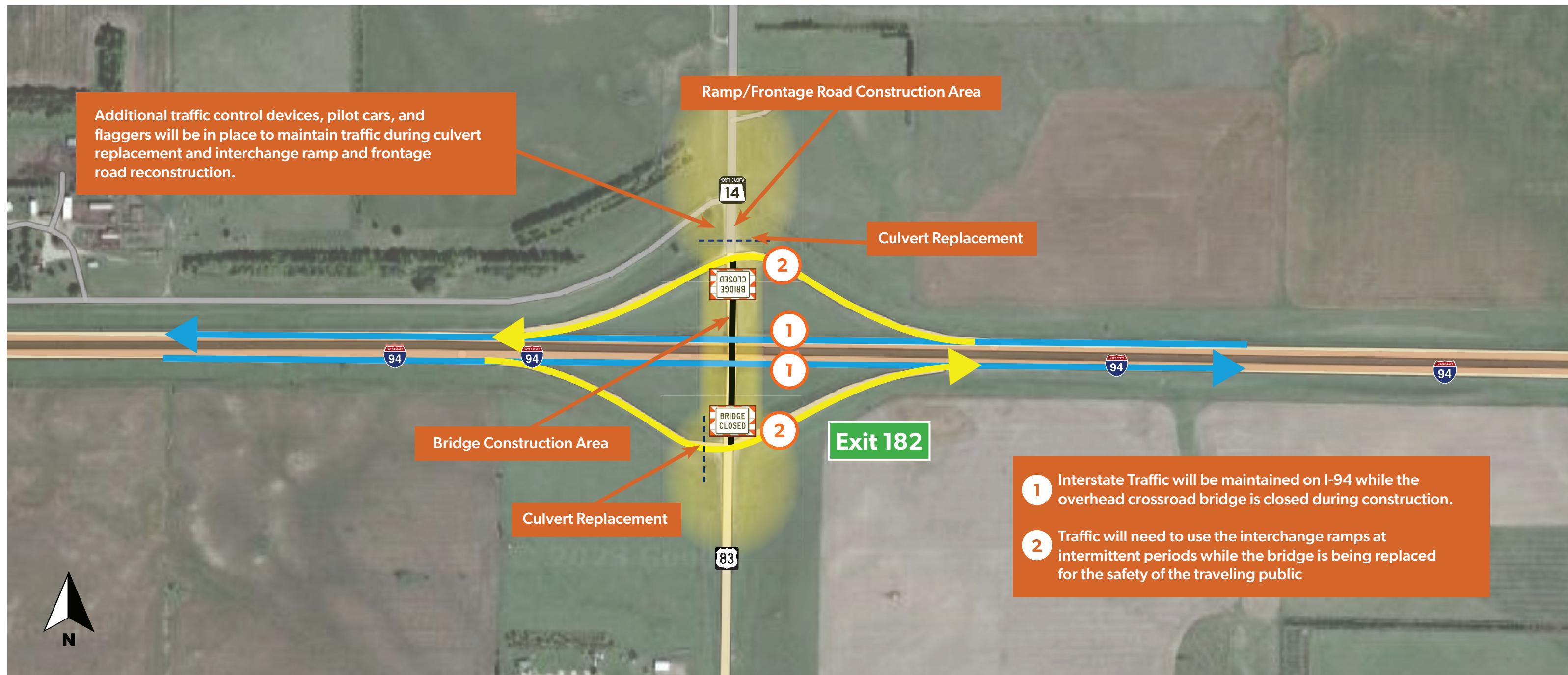
Detour plan for interstate thru-traffic