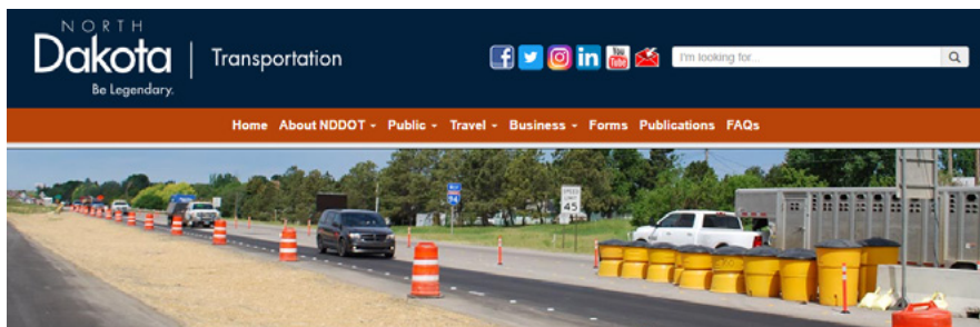
I-94 Interchange (Exit 161) Reconstruction Project