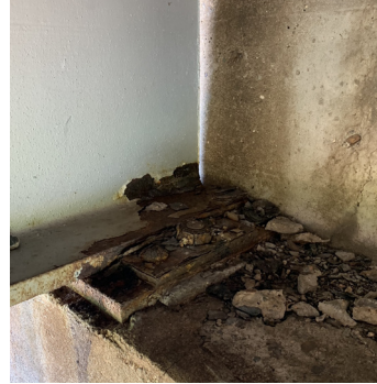
Girder/Bearing Corrosion and Abutment Cracking/Spalling at Bridge 24-000.320