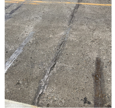
Deck Cracking at Bridge 24-000.320