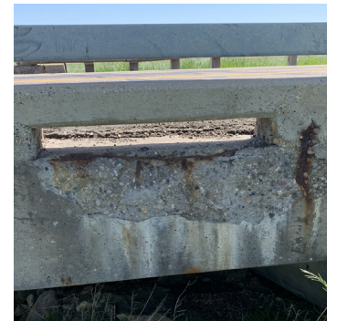
Concrete Girder Spalling with Exposed Rebar at Bridge 1806-035.070