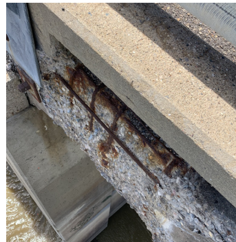
Concrete Girder Spalling with Exposed Rebar at Bridge 1806-034.280