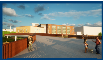
Widened gathering space