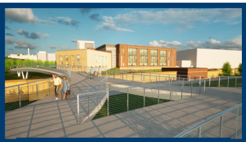
No widened gathering space – space between paths left open