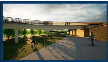
Widened gathering space from below