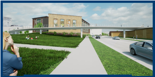
Preserving views of city hall