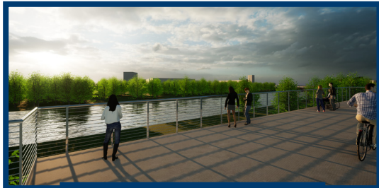
Including a river overlook